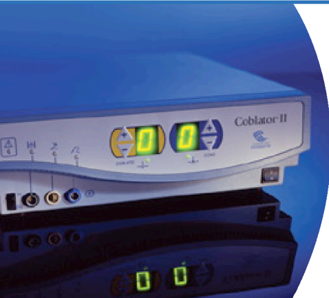
New Coblator II