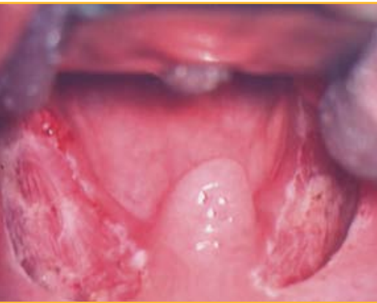
Tonsillar fossae following Coblation Tonsillectomy